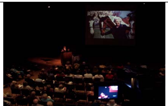
Answering questions after presenting the show Pageantry and Performance at the Philharmonic Centre for the Arts, Daniels Pavilion.