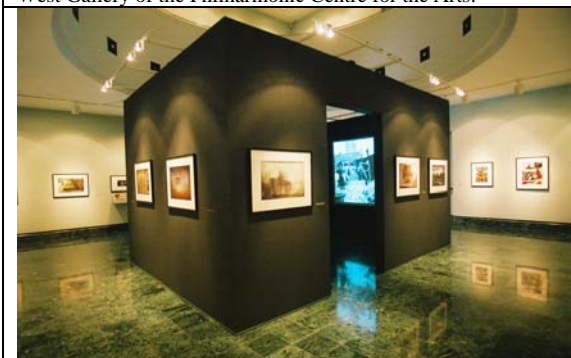
Ongoing multimedia show in the inner gallery.