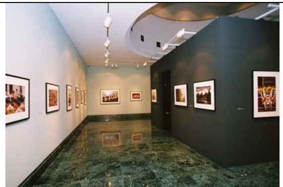
Ground Floor of West Gallery