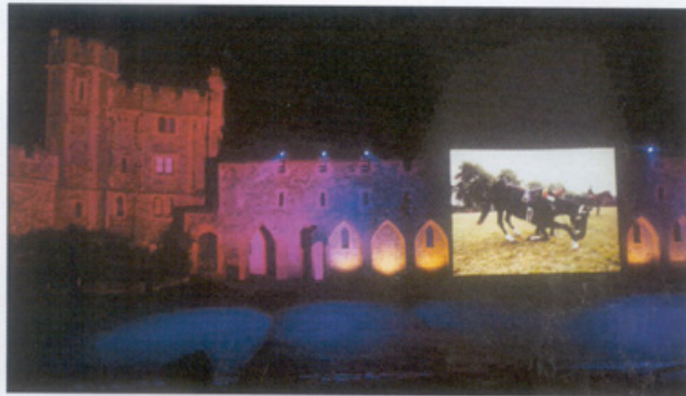
The walls of Windsor Castle light up to Henry Dallal's extravaganza.

Photographs from Henry's collection and new book "Pageantry and Performance" were projected as a Son et Lumiere spectacle on the walls of Windsor Castle with an exhibition at Guildhall as part of Windsor Festival, 2003. See images of the spectacle below.